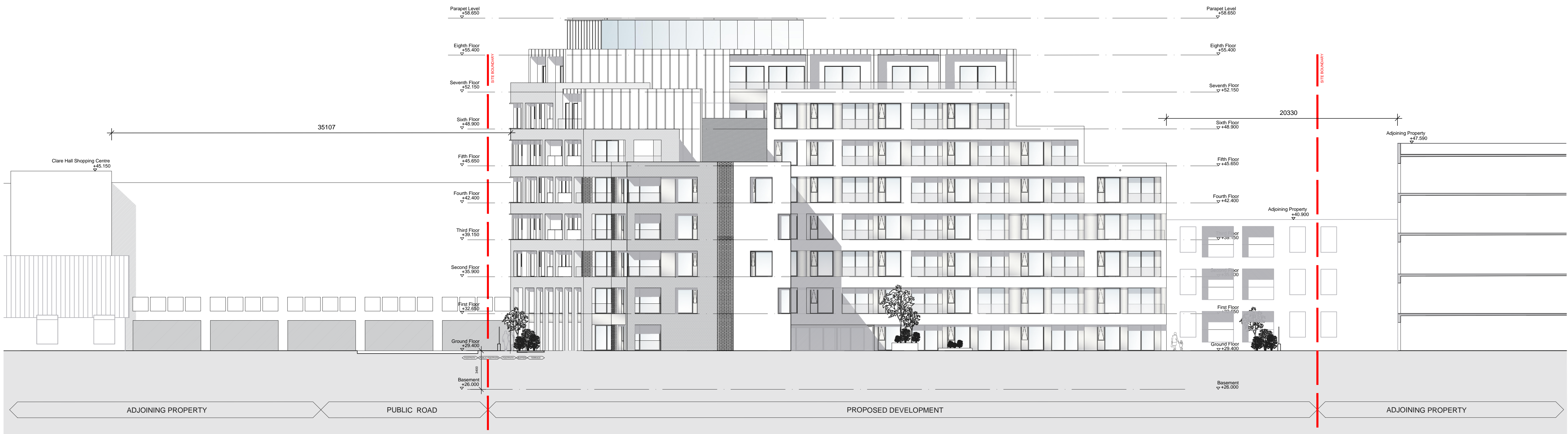
CONTIGUOUS WEST ELEVATION - Scale 1:200@A1