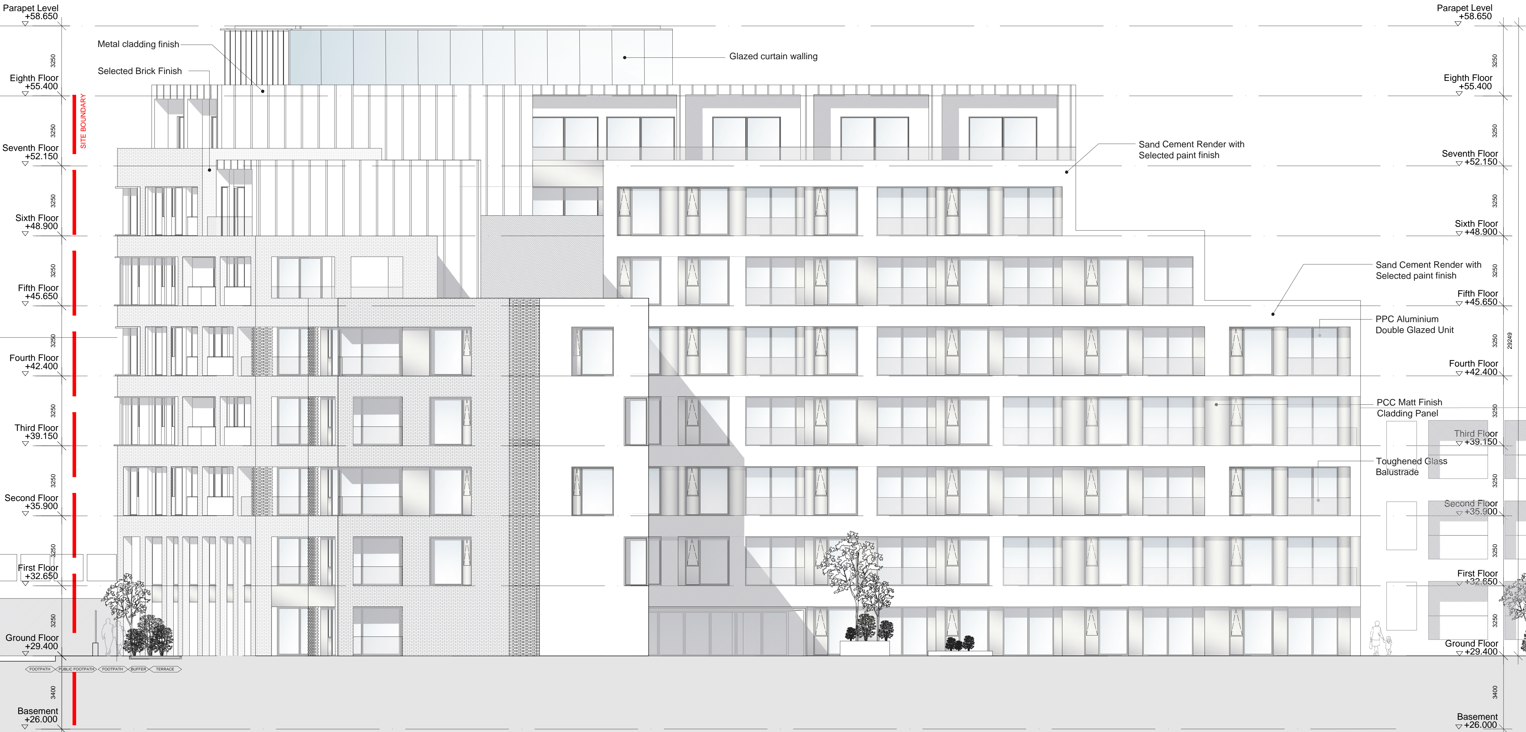
WEST ELEVATION - Scale 1:100@A1

NOTE ALL DIMENSIONS TO BE CHECKED ON SITE NO DIMENSIONS IS TO BE SCALED FROM THIS DRAWING THIS DRAWING IS TO BE READ IN CONJUNCTION WITH RELEVANT CONSULTANTS DRAWINGS